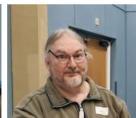
The prize winners - Rogues' Gallery