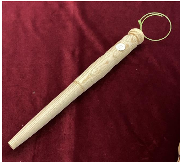
3 rd Jayne Fisher