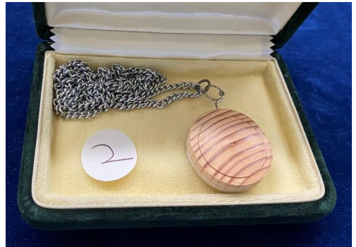
4th - Ian Wright