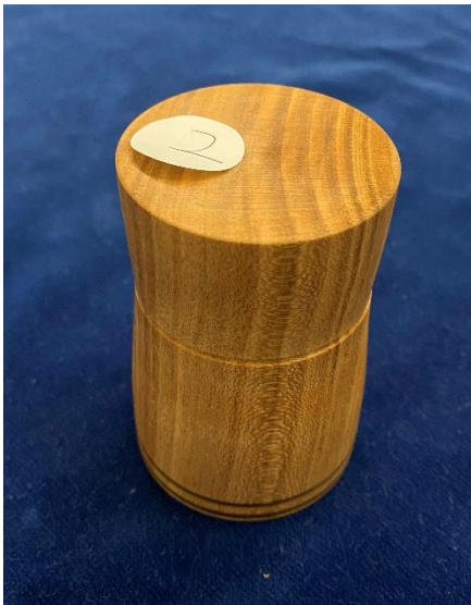
1 st Jane Wild