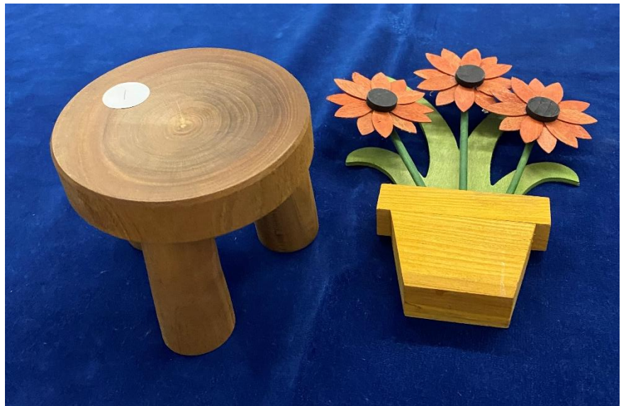
2 nd Nigel Batten