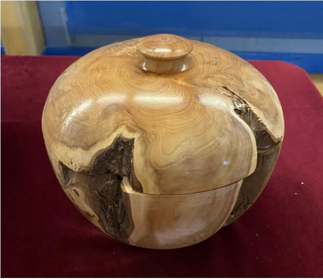
Phil Walker's natural look lidded box