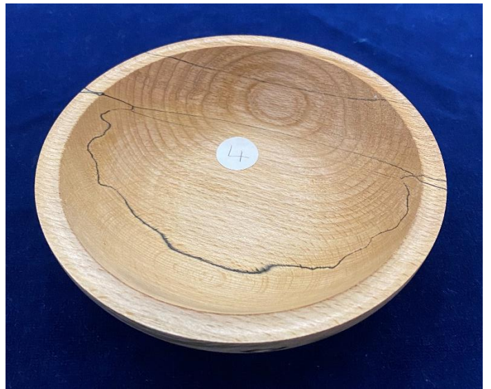
=2 nd Alan Brooks