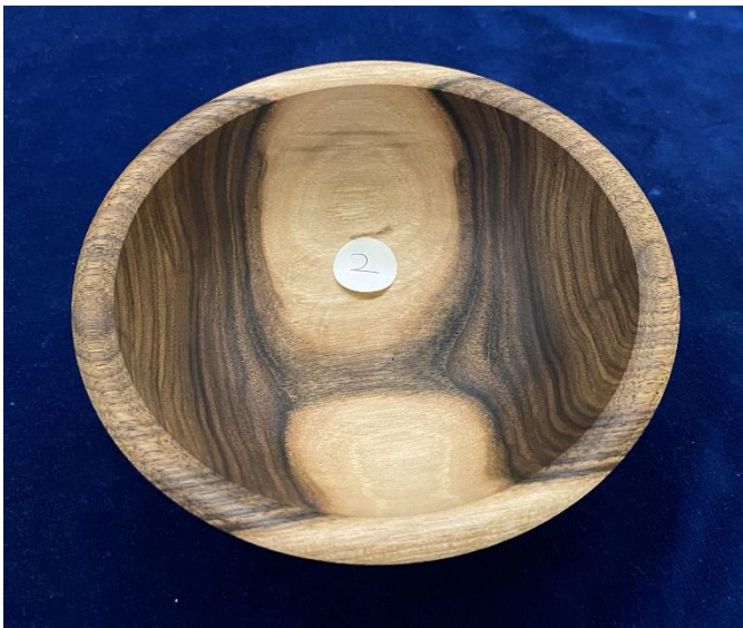
1 st Paul Reeves