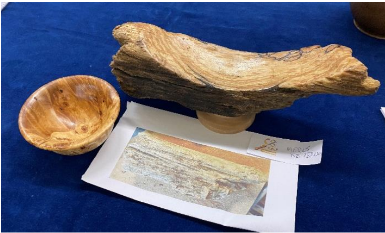
Merls De Pearle