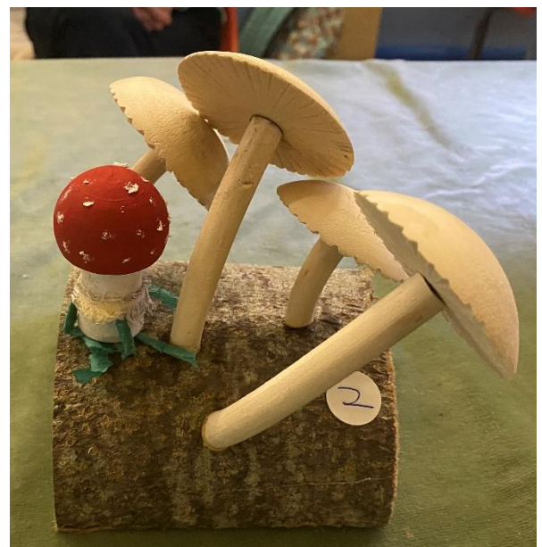
4 th Ian Wright