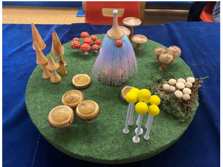
2 nd Alan Brooks