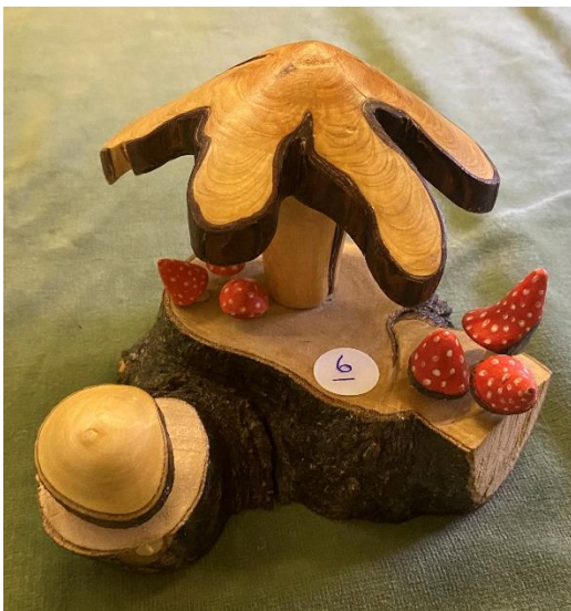
1 st Nigel Batten