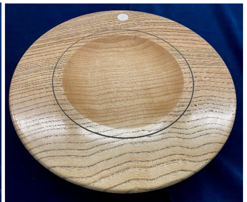
3 rd Alan Brooks