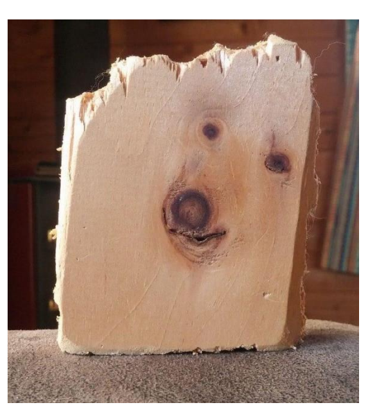
Anyone for some dogwood?