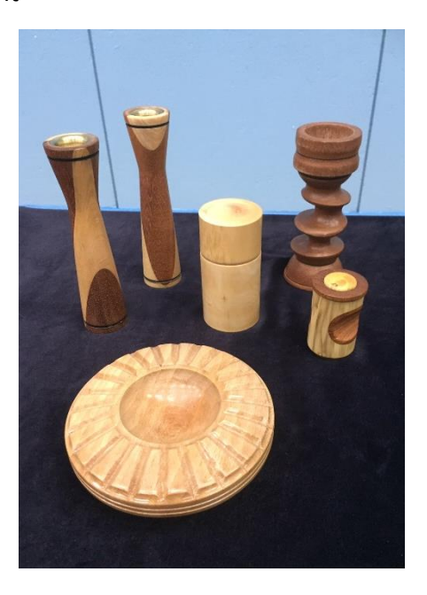
Candlestick / Lampholder Competition – Table A